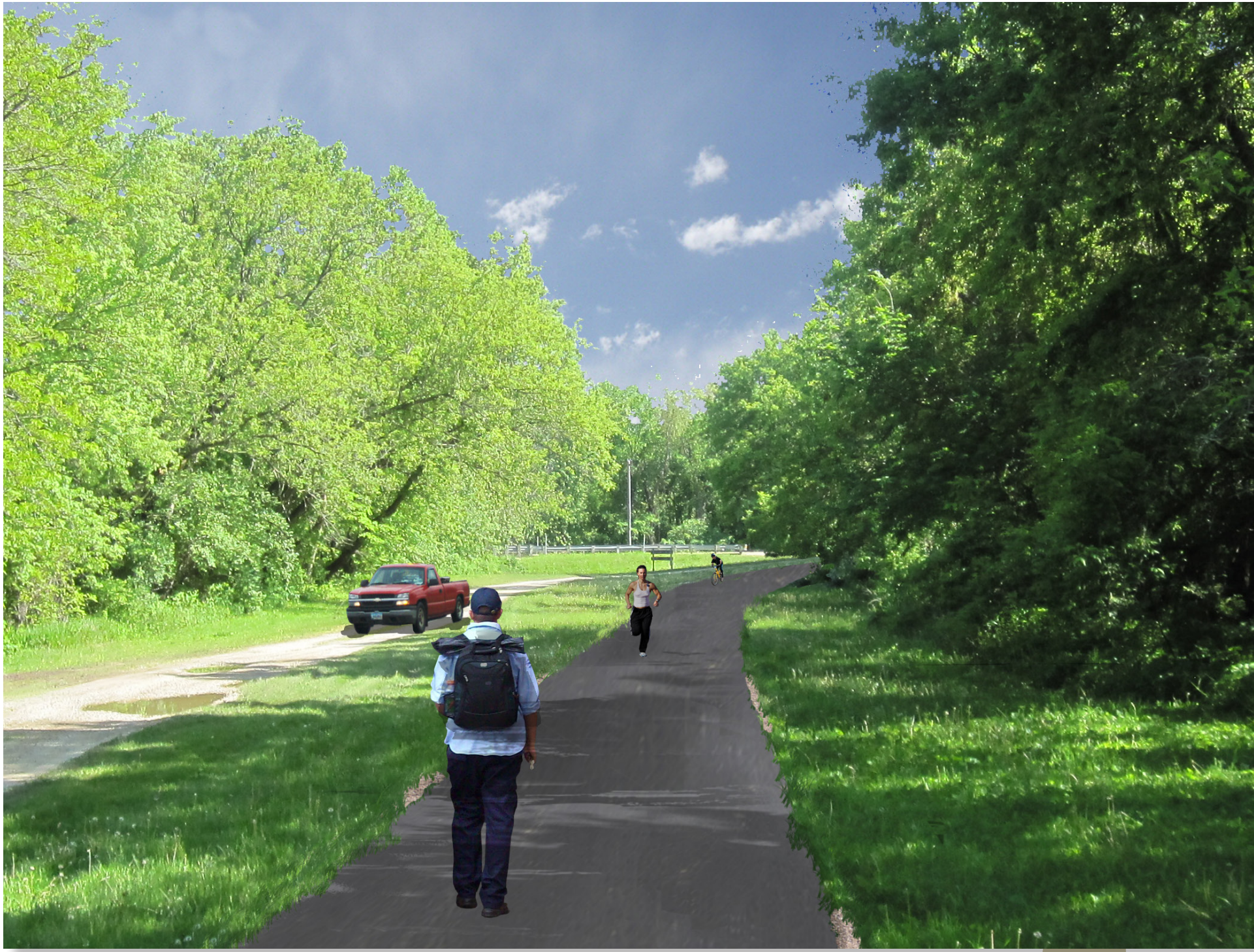
Proposed Sweet Water Trail connecting to bridge crossing Wapsipinicon River to Sweet Marsh