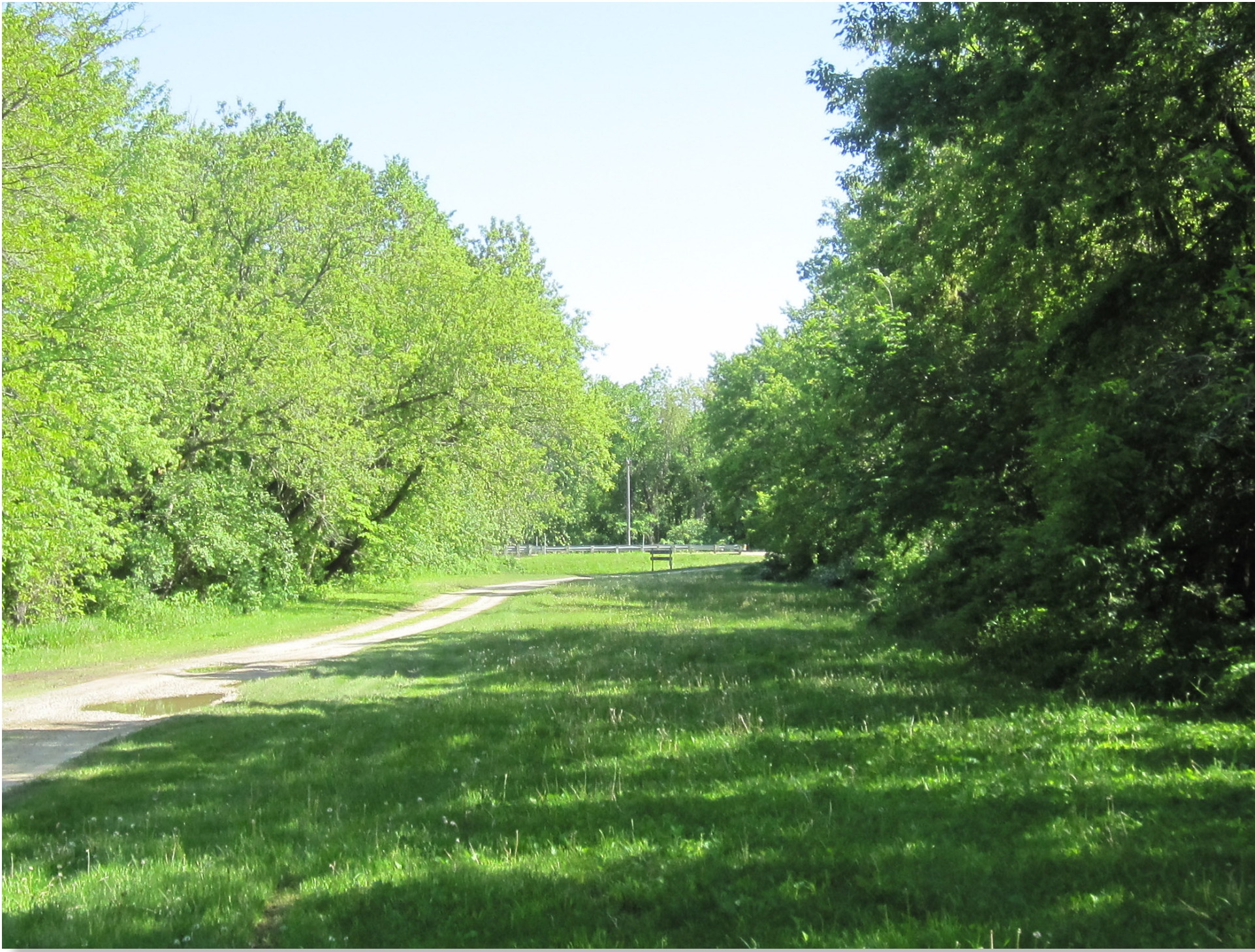
Existing county access along Wapsipinicon River