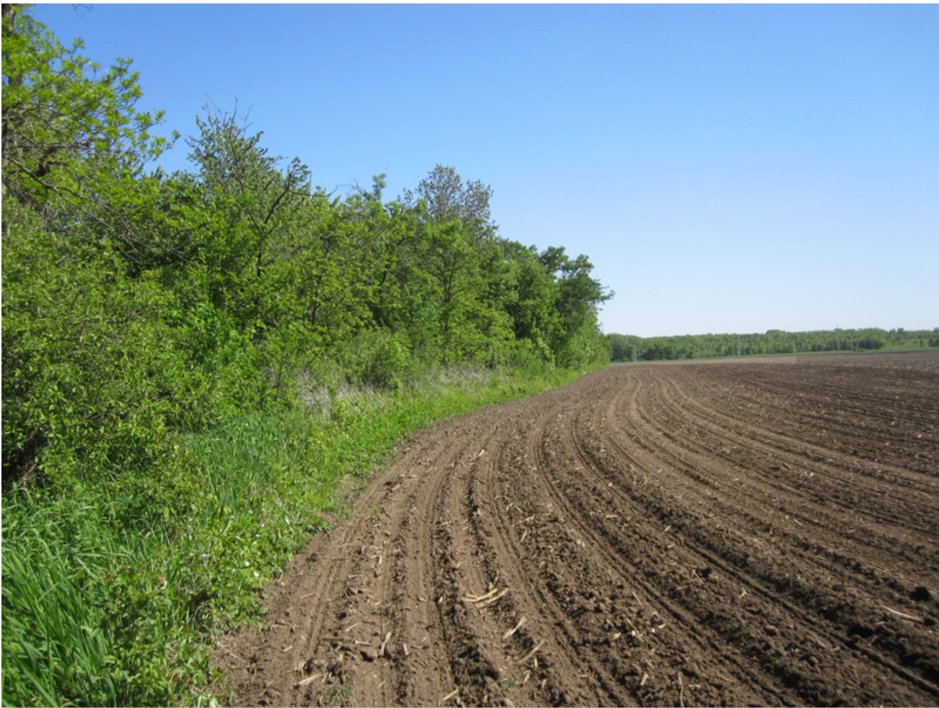
Existing woodland and agriculture field