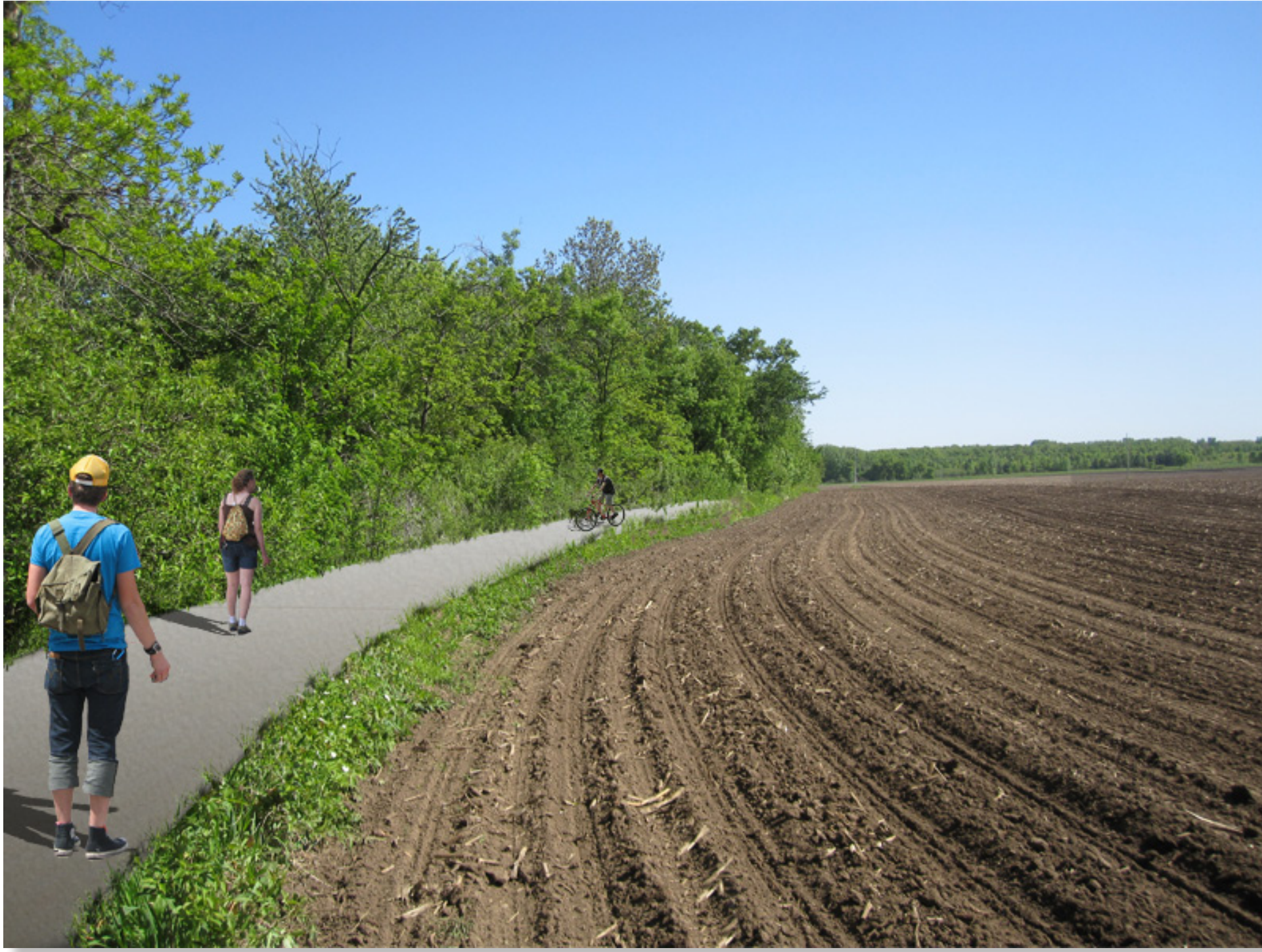
Proposed Sweet Water Trail running parallel to working field