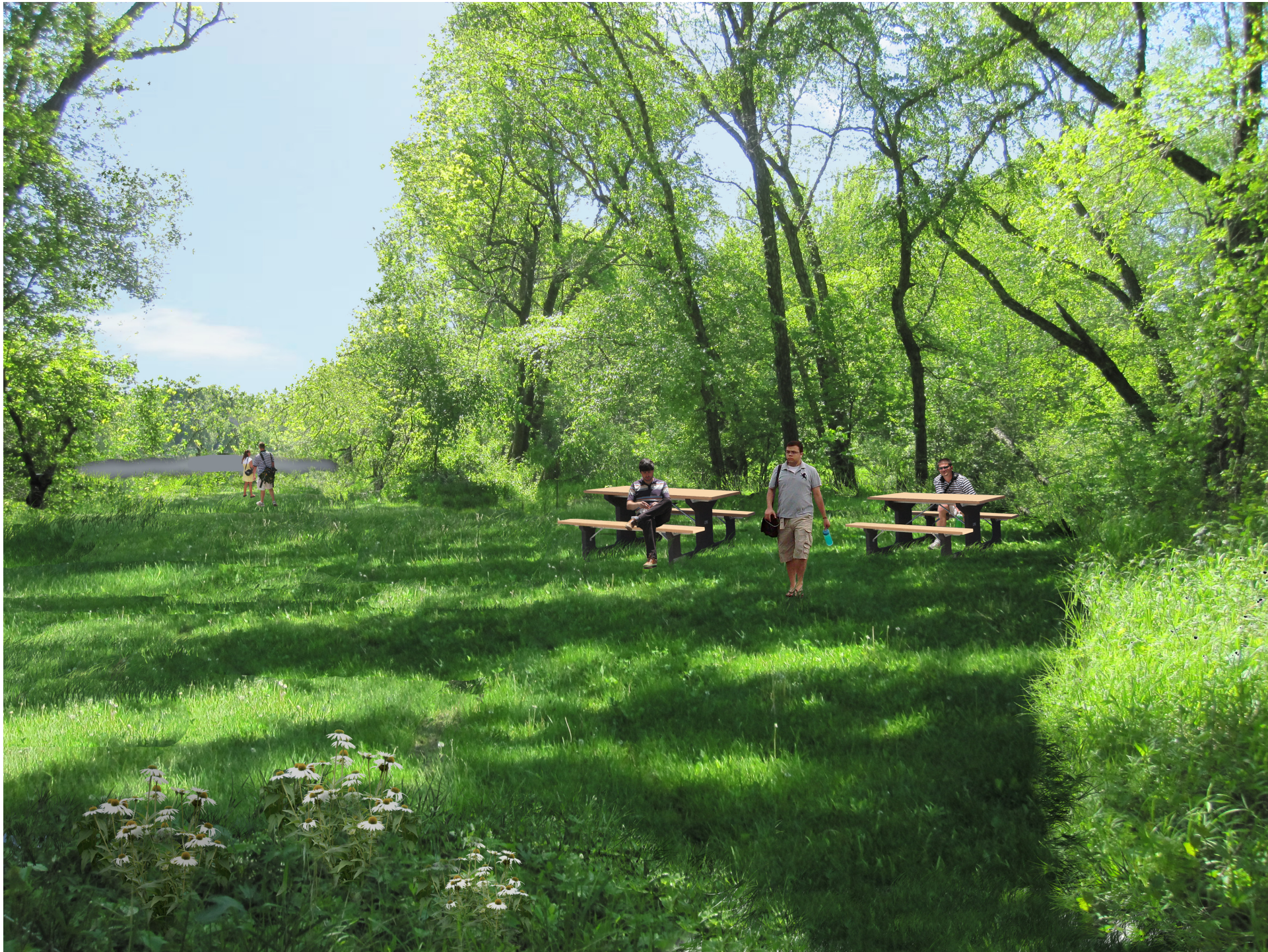
Proposed picnic and rest stop area at the clearing