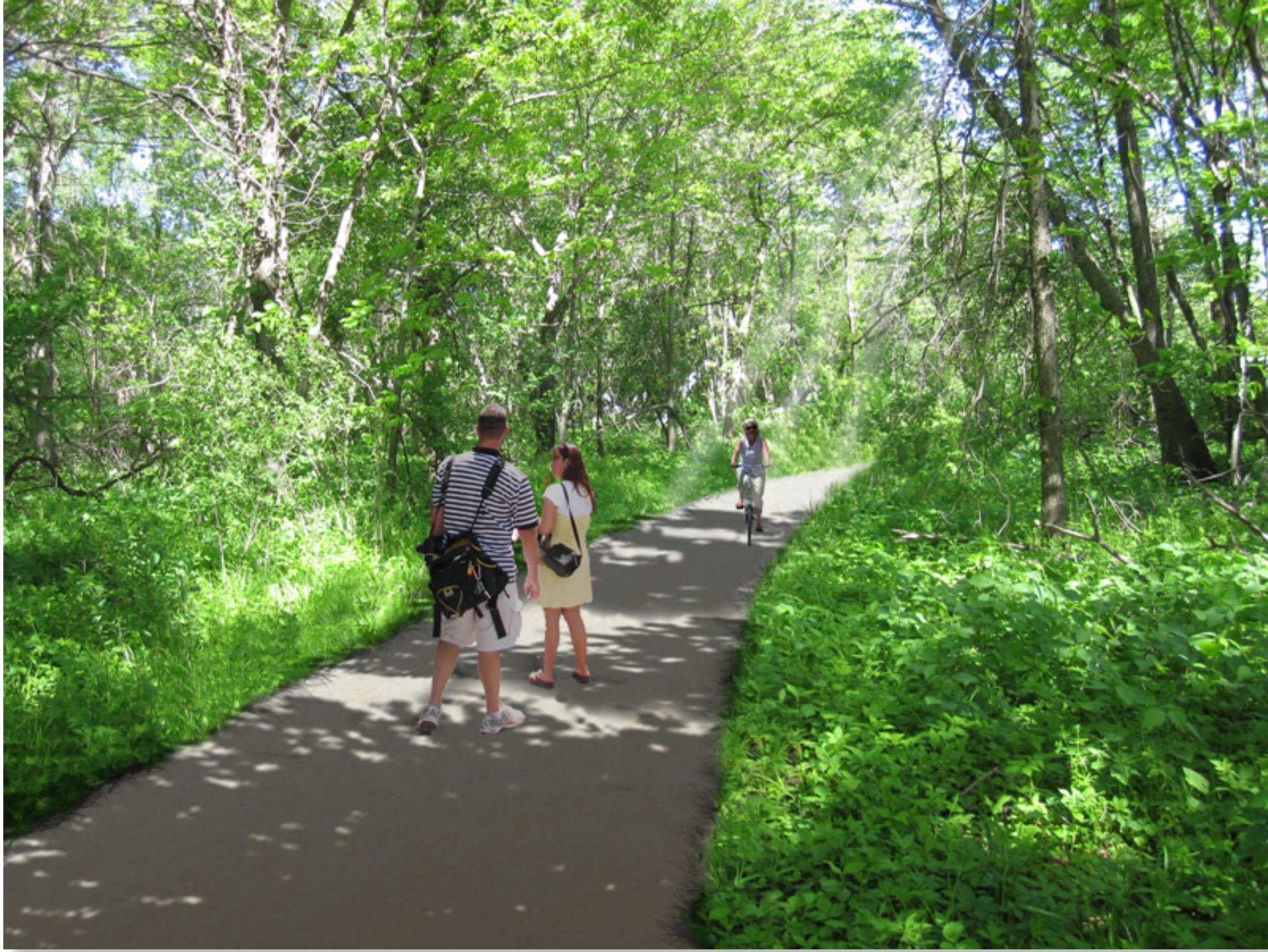
Proposed Sweet Water Trail