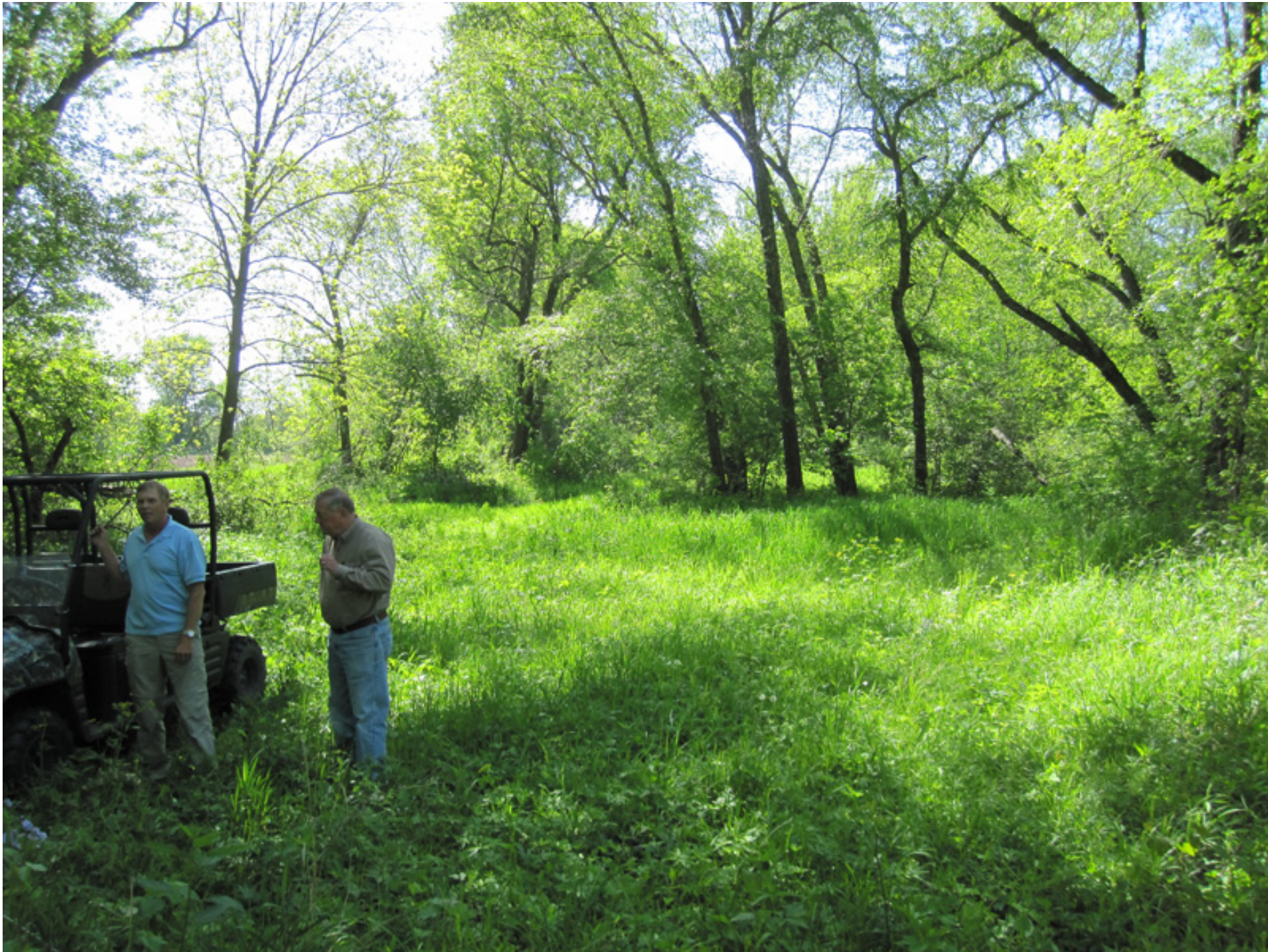
Existing clearing along the proposed trail on the Wapsipinicon River bank