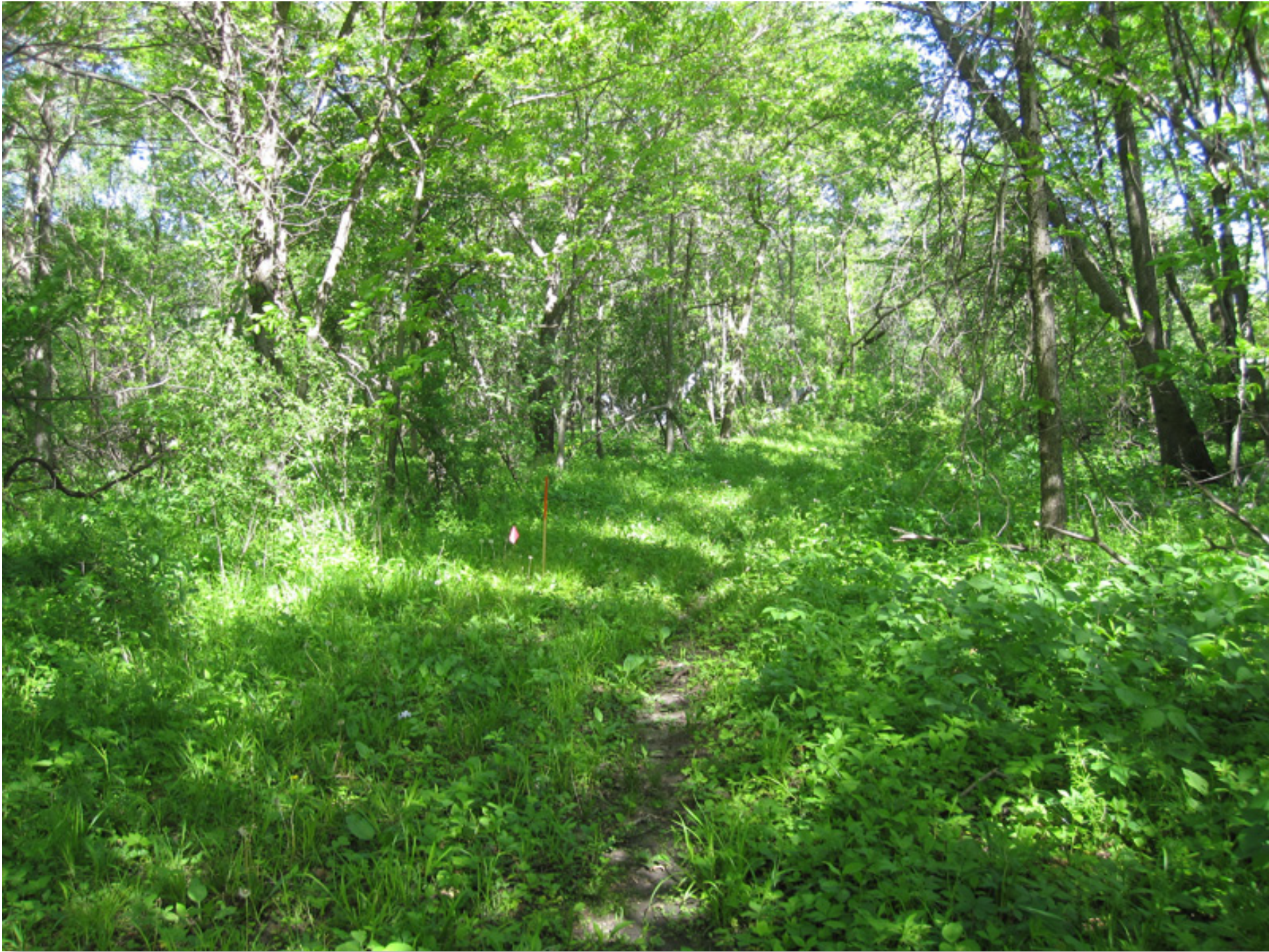
Existing forest along the Wapsipinicon River