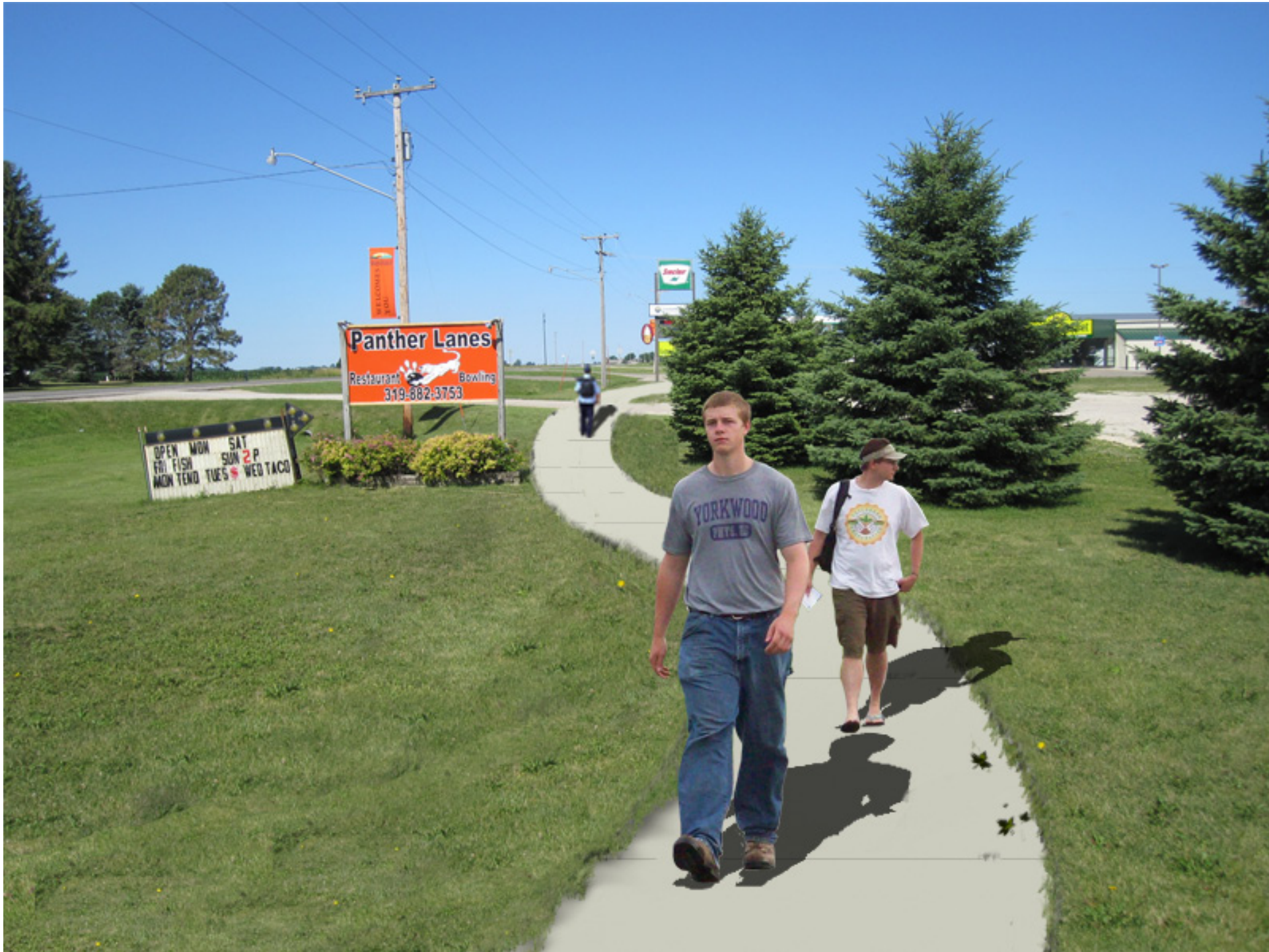
Proposed sidewalk leading to the relocated Guppy's convenience store and the bowling alley