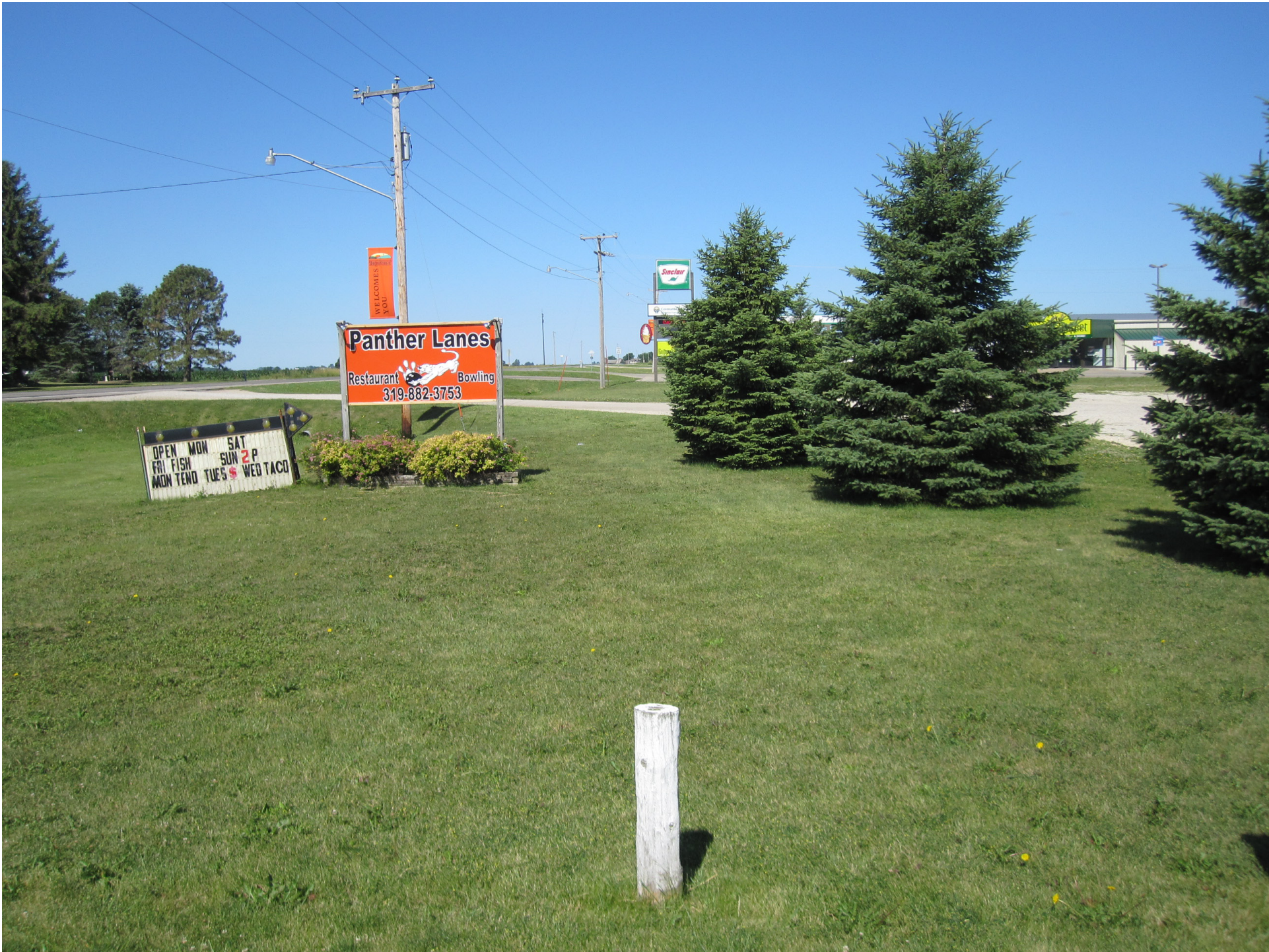
Existing Highway 93 looking west