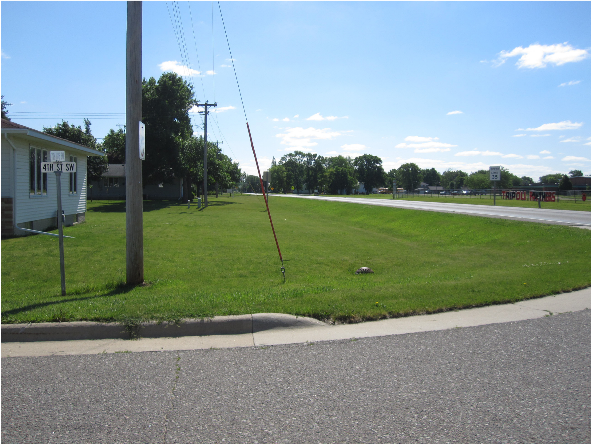
Existing Highway 93 looking east