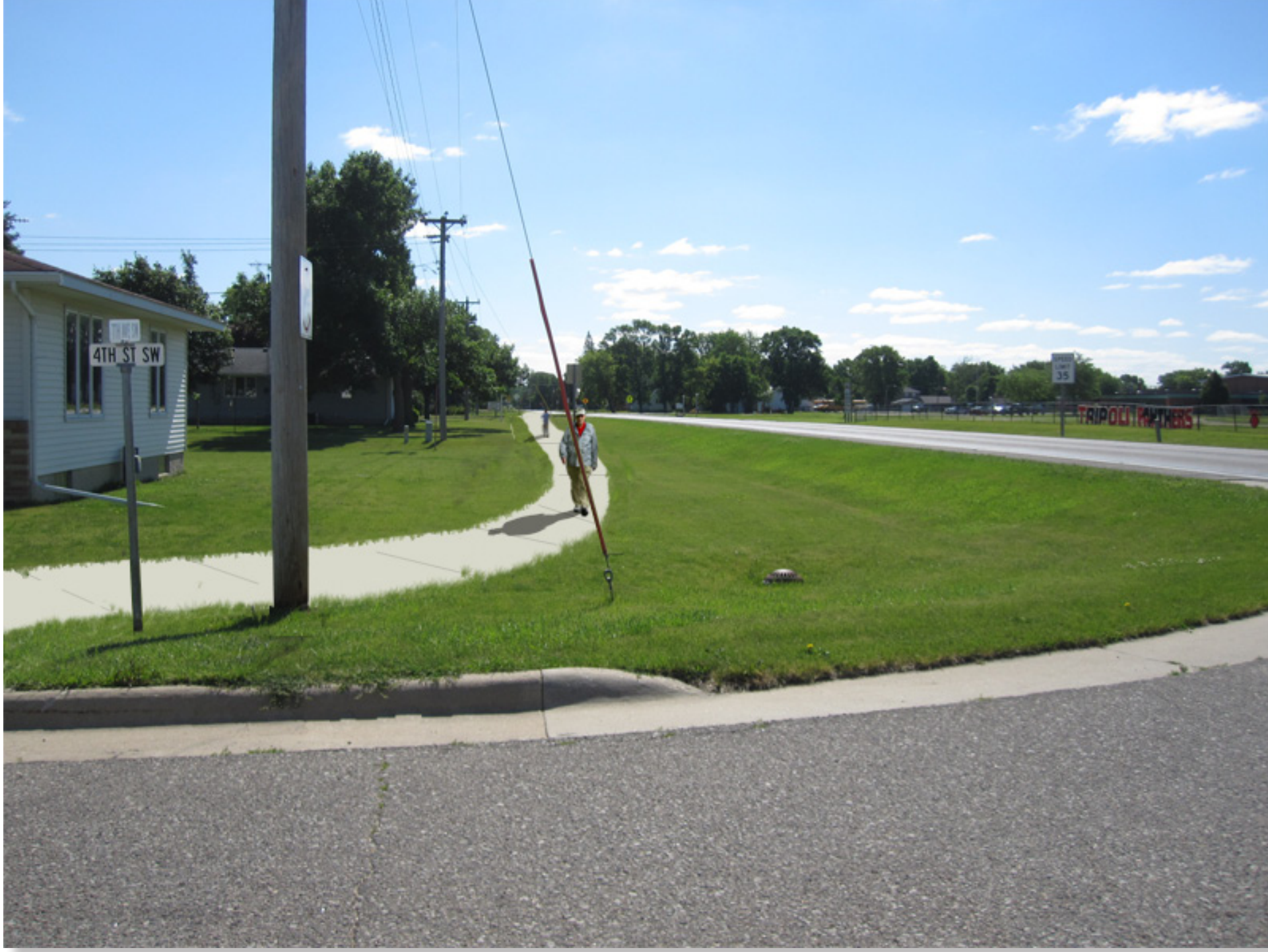
Proposed sidewalk along Highway 93 connecting 3rd Street to destinations along Highway 93